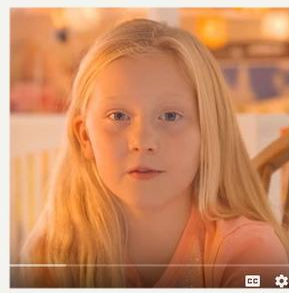
Andie: Little Things Media

HAPPY HOLIDAYS FROM THE STEMIE COALITION!